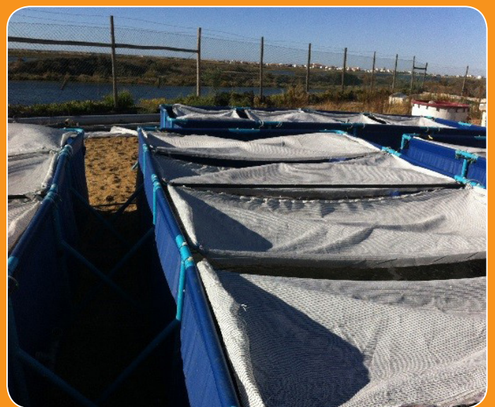
Some of the aquaculture facilities at CCMAR