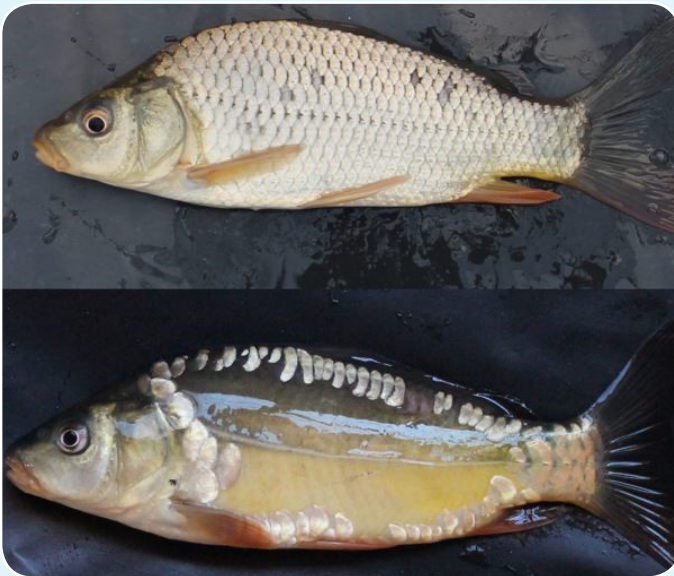
Scaled carp (top); Mirror carp (bottom)

Common carp or European carp ( Cyprinus carpio ) is part of the Cyprinidae fish family, the largest vertebrate animal family, consisting of over 370 genera and comprising approximately 3,000 species. The common carp first originated in the Caspian Sea, before migrating naturally to the Black and Aral Sea basins. However, the Romans were the first Europeans to farm the species, and the spread of common carp throughout Europe, Asia and America is therefore a consequence of human practices.