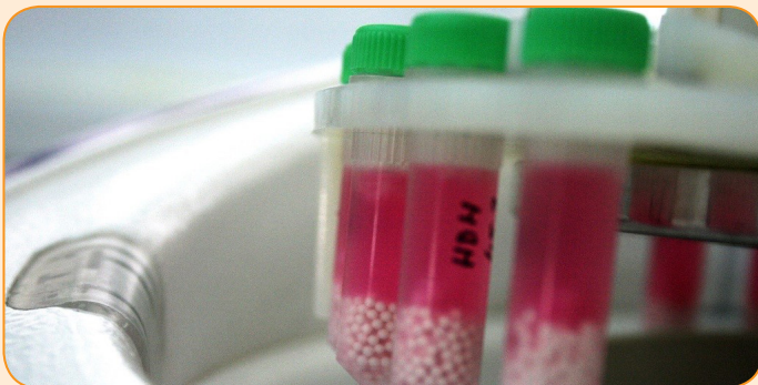
CSIC laboratory analysis.

During 2017, the analytical platform of the Spanish National Research Council (CSIC) at the Institute of Aquaculture Torre de la Sal (IATS-ANA) hosted three AQUAEXCEL 2020 Transnational Access (TNA) projects. They covered different topics of interest for three important farmed fish: Atlantic salmon, gilthead sea bream and European sea bass. The IATS-ANA platform, managed by the Nutrigenomics and Fish Endocrinology Group of IATS ( www.nutrigroup-iats.org ), provides simultaneous gene expression profiling of candidate genes and takes advantage of reliable and curated genetic information for the three fish species.