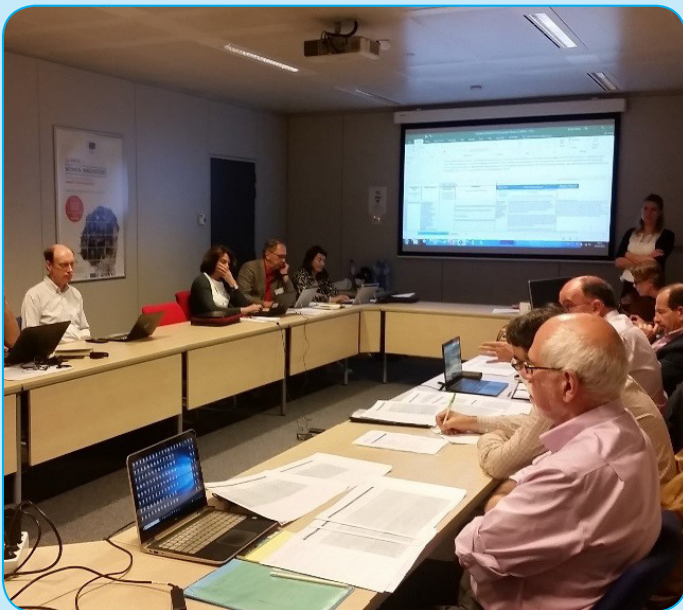
IRAP members discussing promising AQUAEXCEL 2020 outputs in Brussels, April 2018.

Members of the AQUAEXCEL 2020 IRAP met in Brussels (Belgium) on the 18-19 April 2018 to discuss the latest outputs of the AQUAEXCEL 2020 project. The panel discussed and agreed on those project outputs which are likely to be most effective for transfer to the aquaculture industry at present. The